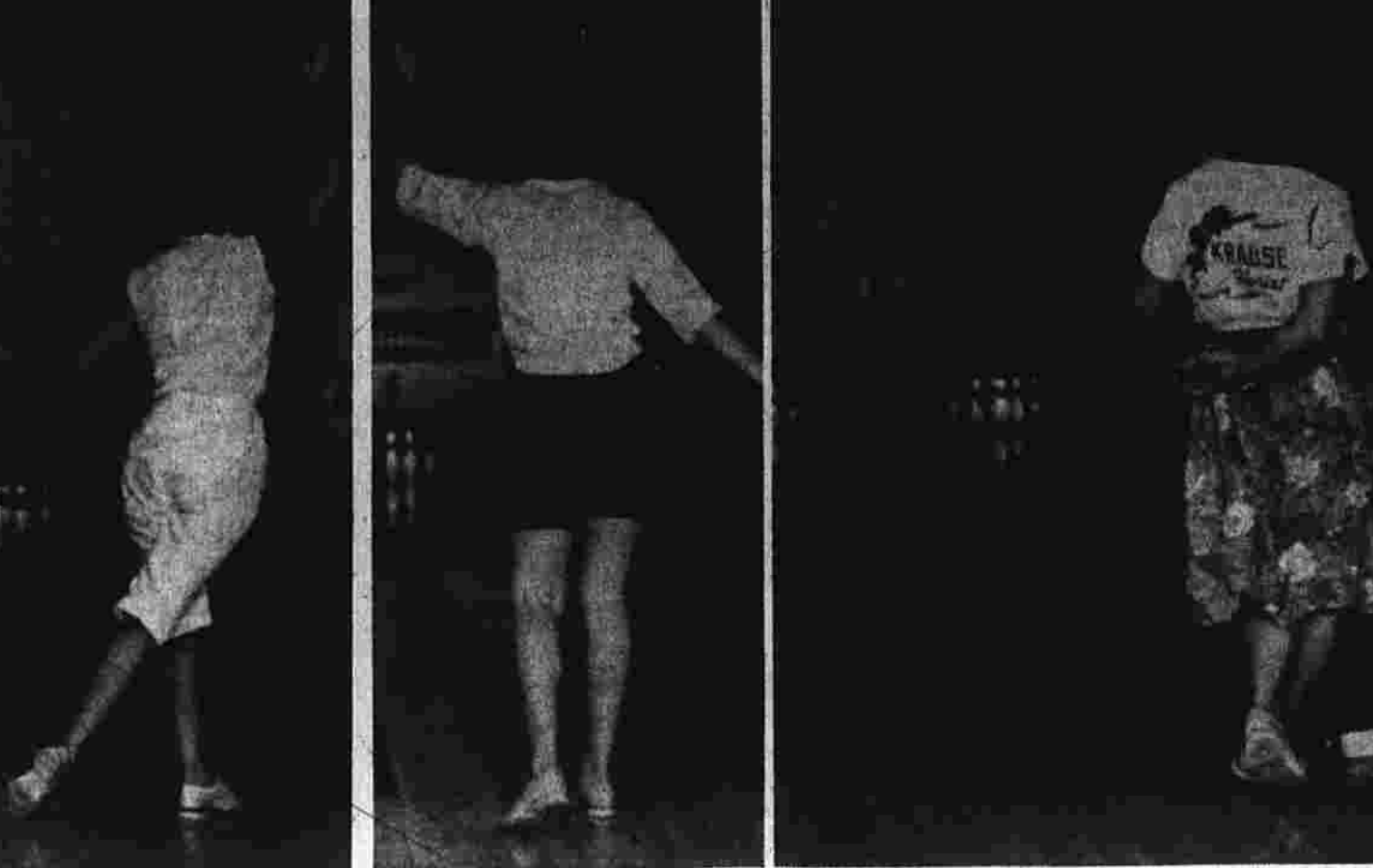
'Southpaw on Target' 'Salute, Head Pin' 'Snap Your Fingers and Watch 'em Fall' 'Nice Form, Eh?' 'Aw, Shucks' 'Now Try This... Behind the Back... Wow!'